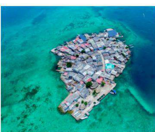
Santa cruz del islote