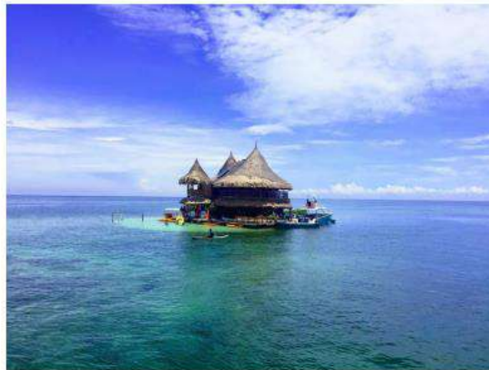
Hostal casa en el agua